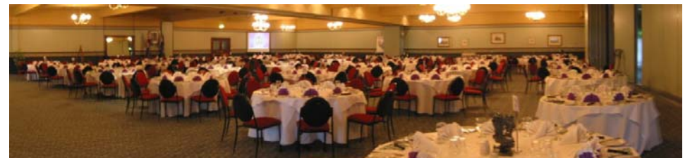
Dining Room at All Seasons Quality Resort Bendigo