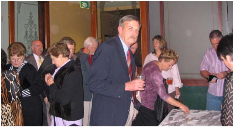
Collecting name badges at the registration desk