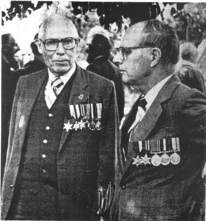
Chatting before the March