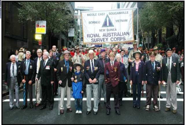
Above — NSW Assoc