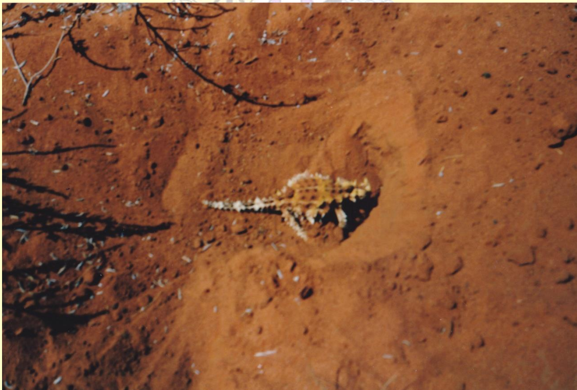
A Thorny Devil. They are harmless, easily missed and a treat to find.