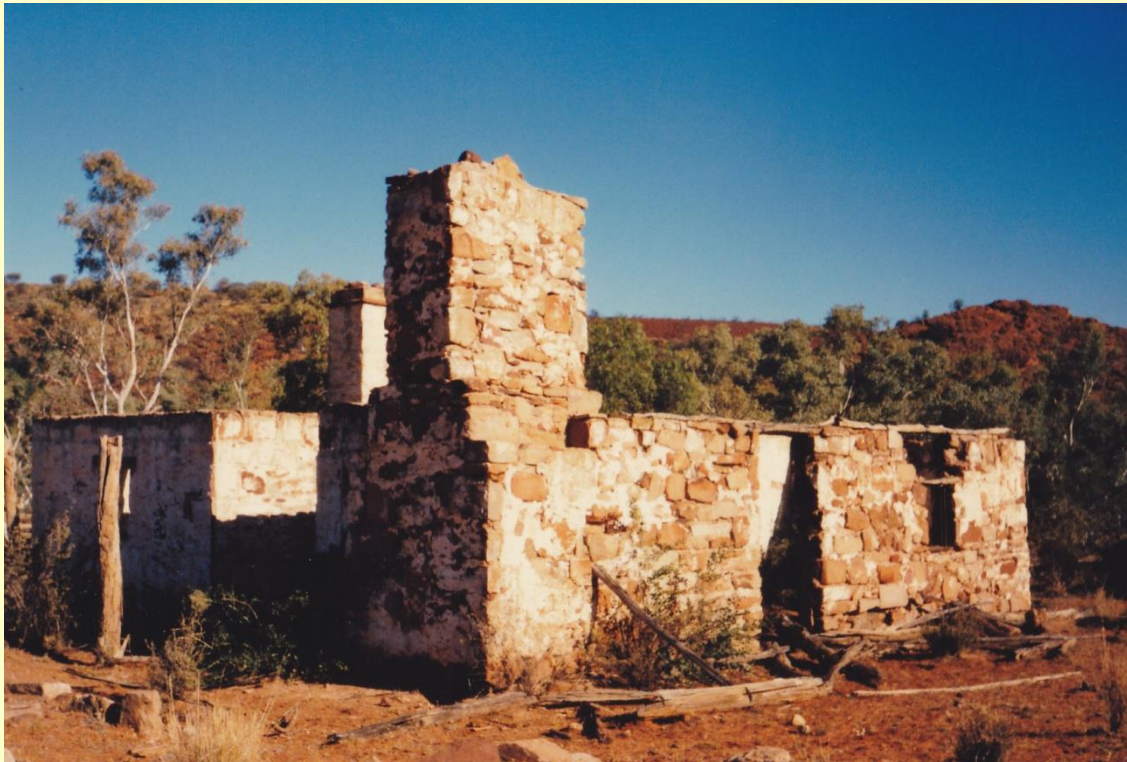
Owen Springs original homestead ruin. A ruin is a good find with excellent landmark value. Nowadays this feature has received substantial preservation work as a tourist attraction.