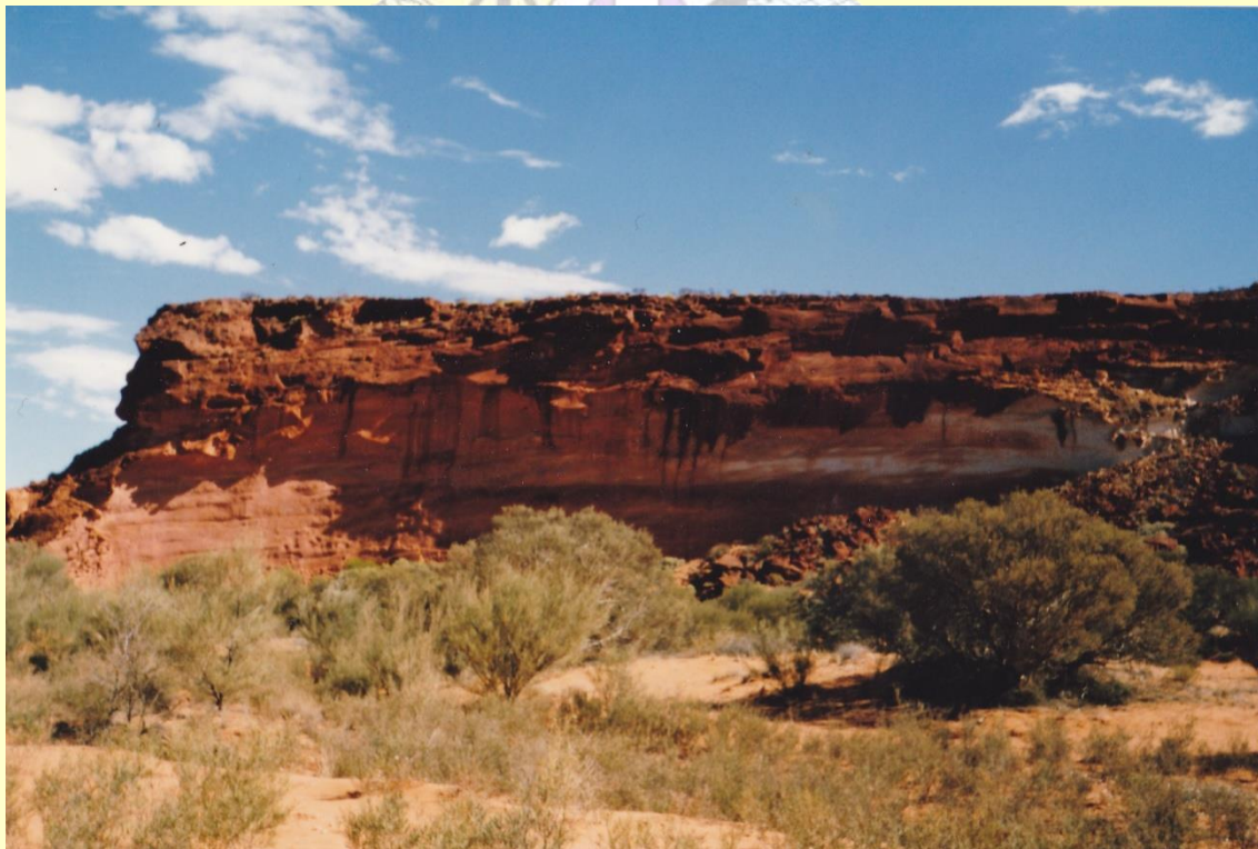
An aspect of Rainbow Valley, is impressive, but no features to add. Once used as a backdrop for the introduction to the TV series 'The Flying Doctors'.