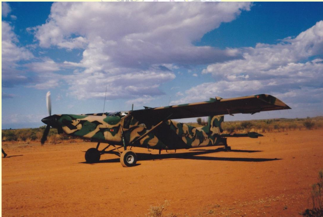
Our Porter used for air annotation and aerial photography. Neale Houston was our air camera operator for supplementary photography. 173 General Support Squadron, Aust Army Aviation Corps, crew were CAPT G Rutter, LT J Grieson, CFN D Polwarth