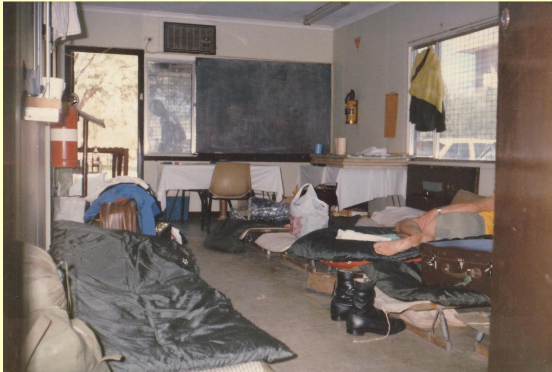
Next base was the NORFORCE Depot in Alice Springs.