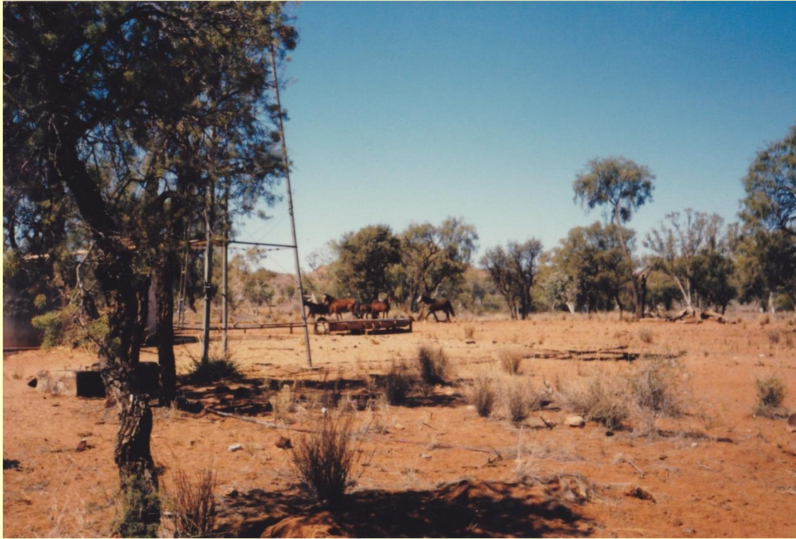
Box Hole Bore. They all look the same, but it is satisfying to be able to add whatever features they offer.