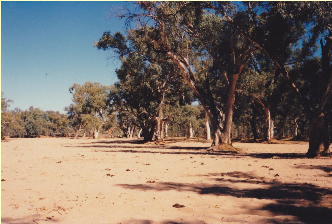
Hugh River - dry and wet