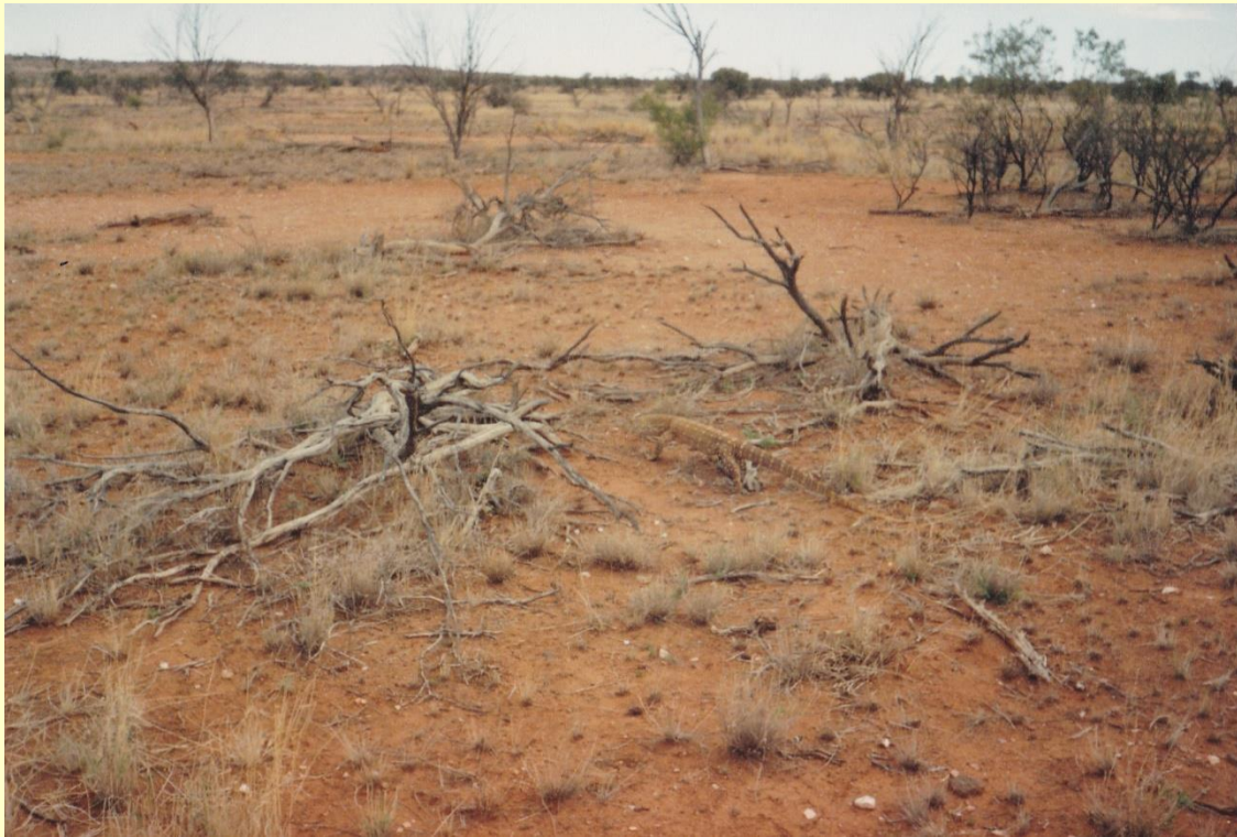
A goanna (maybe a Perentie) in the middle of the photo