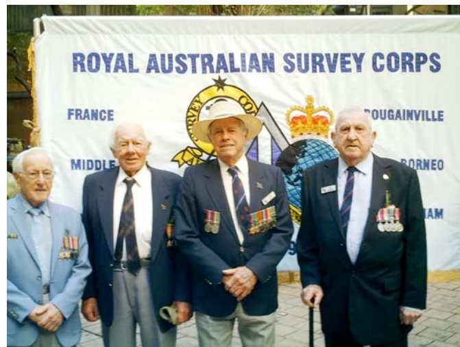
Members of the RA Survey Corps Association (NSW) prior to the start of the ANZAC march 2009

For those who have purchased the corps purple beret & badges please remember to wear them on the day. Members who have not purchased the corps purple beret and would like to do so please see the details below