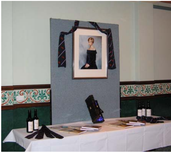
The Association display with Lady Dianna and the new Corps scarves and ties.