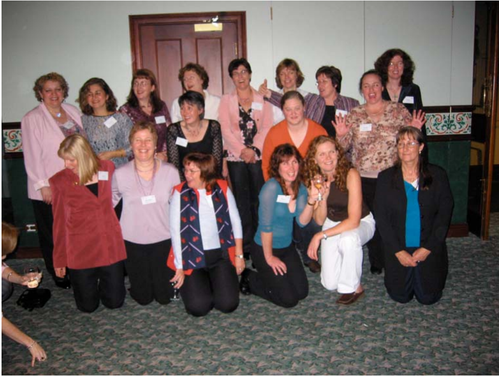
Not to be outdone, the girls who served at Fortuna also had a group photo taken.