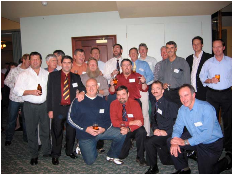
Members of the Fortuna Falcons "Fumblers" Football Team